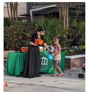
Top Left: Goose Creek Fall Festival, Top Right: "Fraud and Scams" Lunch and Learn, Moncks Corner, Bottom Left: Moncks Corner Halloween Festival, Bottom Right: Market Common Trick or Treating in Myrtle Beach